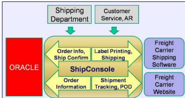
Diagram of shipping from Oracle E-Business Suite Release 12.1 with ShipConsole Version 5

Single interface for shipping, label printing, tracking, proof-of-delivery documentation and Oracle product ship confirmation.