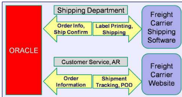
Diagram of shipping from Oracle E-Business Suite Release 12.1 without ShipConsole

Users interact with multiple systems including Oracle E-Business Suite and various freight carrier systems, increasing shipment processing time as well as training time for new users who have to learn to use multiple interfaces.